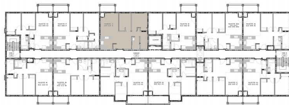
Floor # 1, 2, 3 & 4