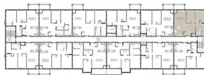
Floor # 1, 2, 3 & 4